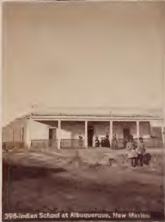
395-Indian School at Albuquerque, New Mexico.